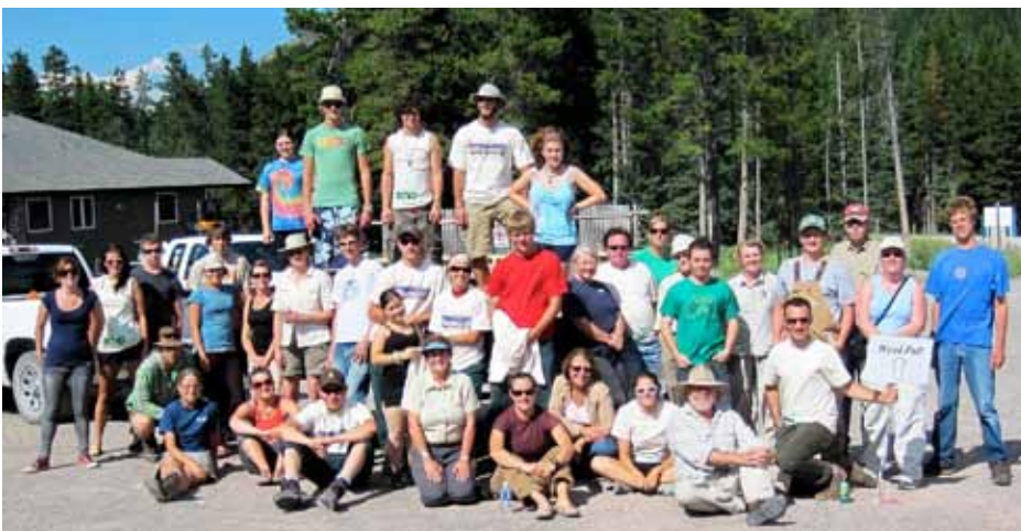
Volunteers had a great day at the 3rd Annual West Castle Wetlands Ecological Reserve Weed Pull.